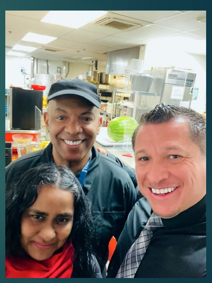
Chef, COO, Principal