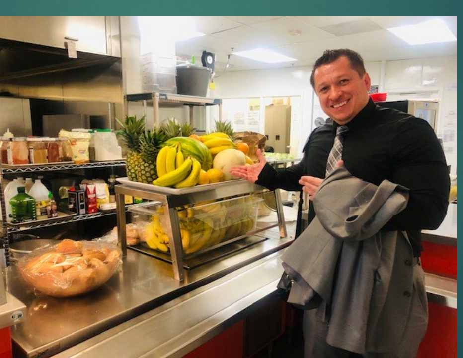
Fresh Nutritious Food